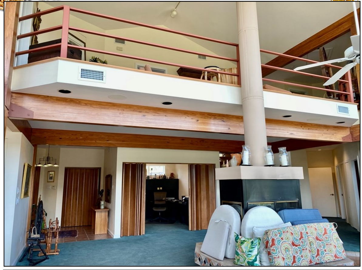
Various angle photos of the central hub looking back from the glass walls. Gives you the perspective from the hub, to the second floor.